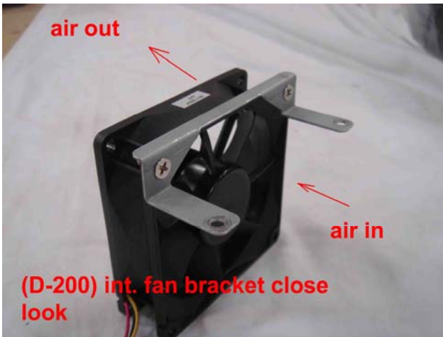
Airflow on D-200 Front Fan