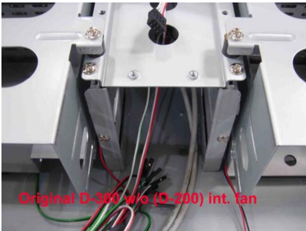
D-300 Chassis without Front Fan