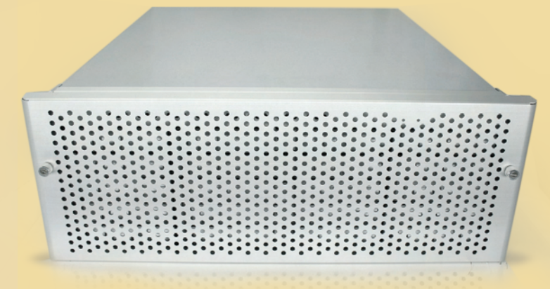
4U 20-Bay Storage Rackmount Chassis

In DVR industry, iStarUSA has taken the initiative to provide cost-effective and customized chassis specifically for BNC and Ethernet connections. From compact 2U to 3U and 4U chassis, iStarUSA can customize the DVR solutions to fit individual needs. Whether is security surveillance or home entertainment, iStarUSA have high quality, high scalability, and cost effective chassis for all DVR systems.