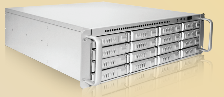
3U 16-Bay Storage Rackmount Chassis

Since computer technology has been developed rapidly, many medical and healthcare institutes are transferring data like ultrasound and radiography from film and videotape to digital imaging systems. In order to accurately access to the data and store enormous digital records, iStarUSA offers storage rackmount chassis for storing huge amounts of data.