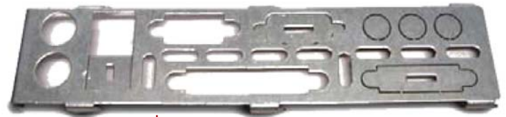
Custom I/O Shield H