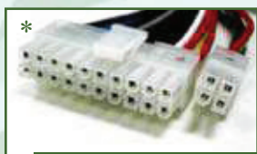
20+4 Pin Connector