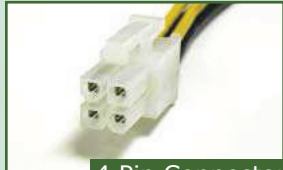
4 Pin Connector