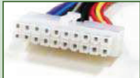
20 Pin Connector