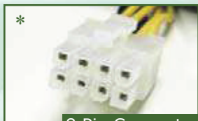
8 Pin Connector