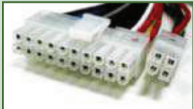
20+4 Pin Connector