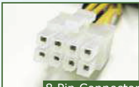
8 Pin Connector