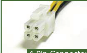
4 Pin Connector